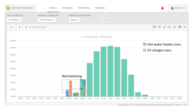
Figure 3 - SEMS-BL mock up.

1.2) A sustainable energy management system at the building level (SEMS-BL) that integrates an optimisation algorithm is being coupled with the equipment installed in the test building (Figure 3). Through the coupling of these equipment with the SEMS-BL, it is possible to optimize the use of variable loads in order to optimize self-consumption and reduce peak loads, thus reducing the energy consumption and minimize the renewable energy not being used on premises. The testing of such a system will allow the DSO to identify the benefits of such systems for the building owner and will provide useful inputs on how to enlarge its set of services to the stakeholders, enhancing and enlarging its role of market facilitator.