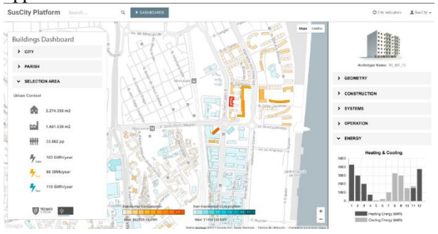
Figure 5: Buildings Dashboard (ref )

This product may be a driver for local economy by promoting both the creation of new EER-related companies and the expansion of business activities of the existing companies that will take advantage of EER opportunities.